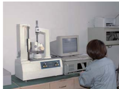
微机控制齿轮综合测试仪 Microcomputer Control Gear Test Instrument