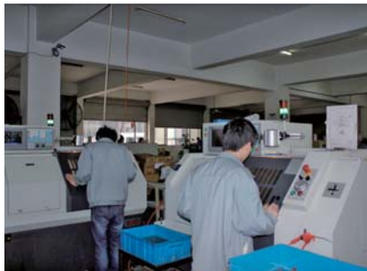
精密数控车床 Numerical Control Lathes