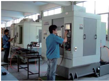
自动换刀数控全自动加工中心 CNC Machines

全部精密零件，包括齿轮、内齿轮、结构件等，都由集团公司内部自己加工，具有强大的生产能力。 All precision parts including motors, gears, inner gears, structural parts are made by the group itself. Thus the group has powerful production capacity.