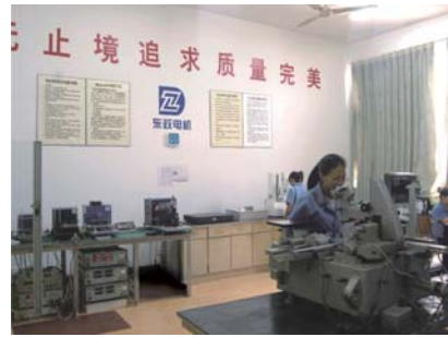
检测中心 Test Center