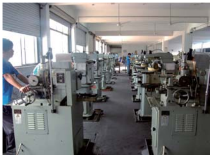
精密滚齿机车间 Precise Hobbing Machines Workshop