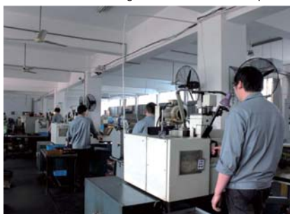
数控全自动精密滚齿机 Automatic Numerical Control Hobbing Machines