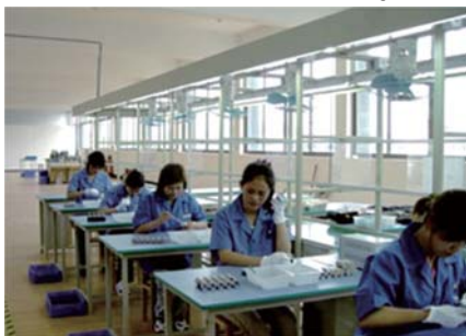
行星齿轮电机装配线 Planetary Gearmotors' Assembly Line