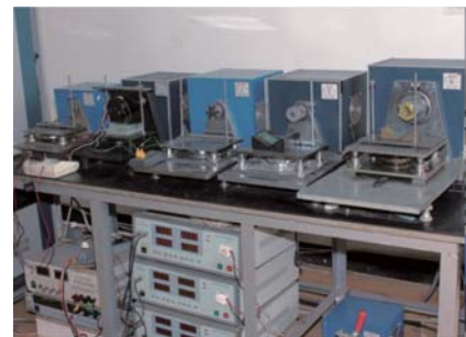
电机特性测试仪 Motor Performance Test System