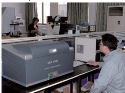
RoHS测试仪 RoHS Test Instrument